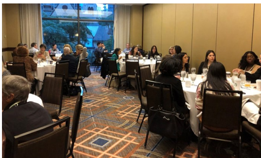
National Initiative IX Meeting One October 2023 Omni Chicago Hotel

The AIAMC National Initiative is the only national and multi-institutional collaborative of its kind in which residents lead multidisciplinary teams in quality improvement projects aligned to their institution's strategic goals.