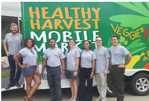
TriHealth Team Cincinnati, OH National Initiative V: Improving Community Health and Health Equity through Medical Education 2015—2017

Completed applications are due no later than MONDAY, JUNE 2, 2025 and must be emailed in Word format. All applicants will be notified of selection in late June, followed by pre-work this summer and our first meeting in October. We hope you will join us in the milestone TENTH National Initiative!